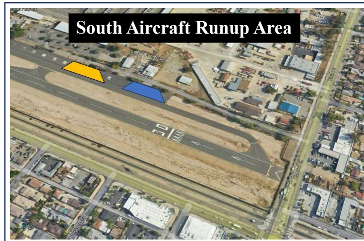
South Aircraft Runup Area

Whiteman Airport 10000 Airpark Way Pacoima, CA 91331