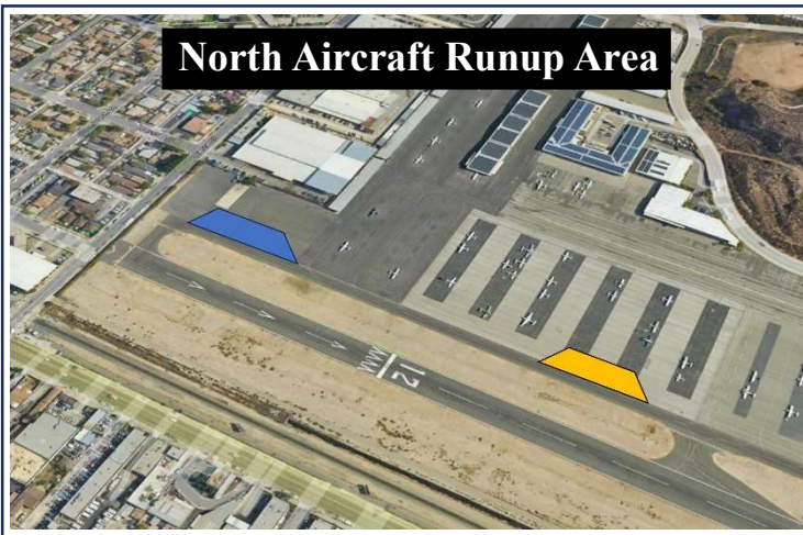
North Aircraft Runup Area

Potential New Location for Aircraft Runup Areas